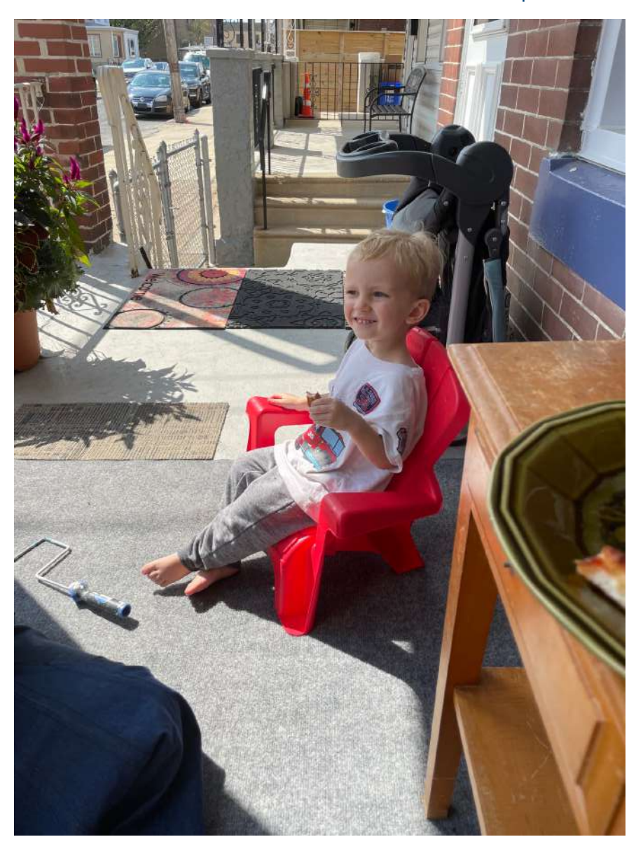
(Learning to people-watch from the porch like a true Philadelphian!)